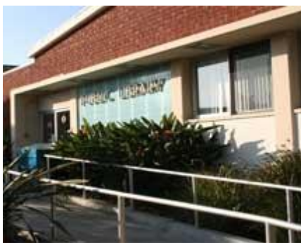
Hermosa Beach Library 550 Pier Avenue

E-Resources, including downloadable books and audiobooks as well as on-line ordering of books from the County system, and Wi-Fi are popular features of the Library. In the past year 9 12,221 books and audiobooks were downloaded by the library’s customers. The library has six public and two children’s computers which were used by 2,448 customers for a total of 9,120 sessions (444 hours last year).