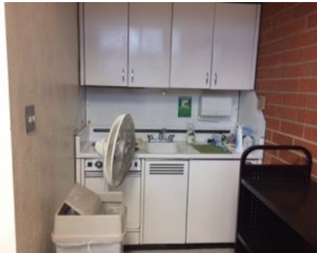
Staff Kitchenette and Storage Area

inaccessible. The exterior doors are not power assisted. Clearances at doors and set backs of security gates do not meet current codes.