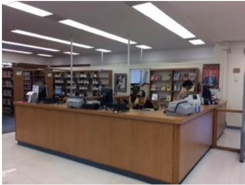
Customer Service Desk

Space Use. The dual entrances create an inefficient use of space requiring an excessive circulation allowance 15 . The customer service desk is oversized and the reference desk, which is also large, is located close to the customer service desk. As noted above, the facility is 6,496 square feet. If the rest rooms were upgraded and the contents of the current facility were removed and then returned with adequate clearance to meet current disabled access, building and fire and life safety codes, the space required would be at least 7,500 square feet. Meeting accessibility requirements would trigger a net loss of approximately 8,000 volumes (17%) and 11 reader seats (22%) or their equivalent. To illustrate this point, Appendix D contains the floor plan for the recently remodeled Lomita Library. With similar contents, the Lomita Library requires 8,000 square feet of space 16 .